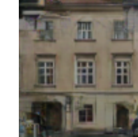
Q_8(w, f) \rightarrow P_{0.5}(w, f)